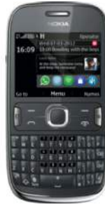
Figure 1: The Nokia ASHA 302 mobile phone with QWERTY keyboard