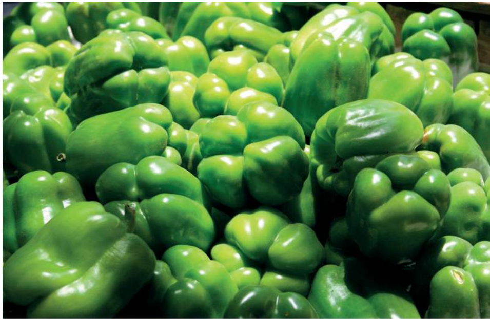
Figure 3: Green peppers on a market stall