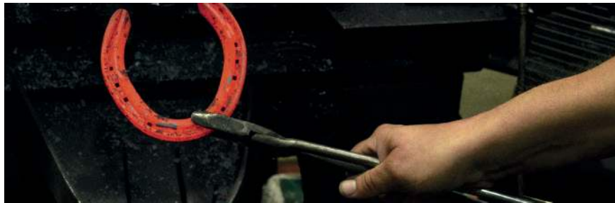
Figure 5: Manufacturing a horseshoe