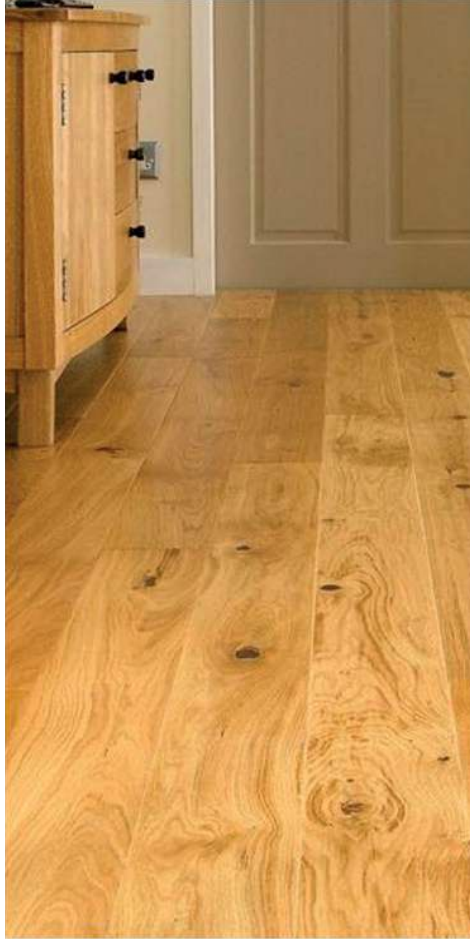
Figure 4: A hardwood floor