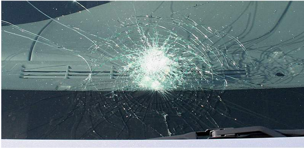
Figure 6: A car windscreen damaged by impact